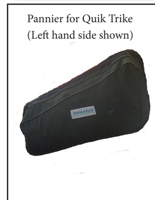
Pannier for Quik Trike (Left hand side shown)