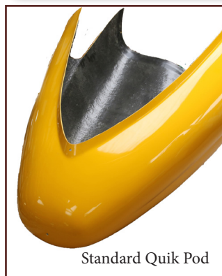
Standard Quik Pod