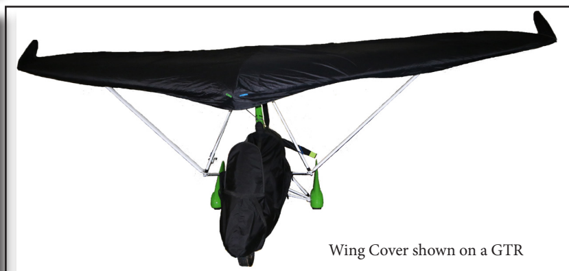
Wing Cover shown on a GTR