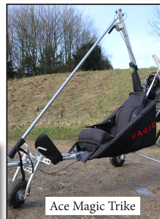
Ace Magic Trike

We are wanting to find a home for our last two remaining budget Ace trikes. They are brand new without engine and on offer for: Complete Trike & Wing (Less engine) for £4995 inc VAT. Wing only £1800 inc VAT. (We have four wings in stock available).