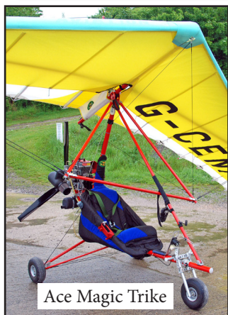
Ace Magic Trike

We also have a Brand New SDR Orange Quik Lite 'Executive' (as seen at the Flying show and Spamfield) with all the options fitted including Electric trim, Explorer pack with large wheels and advanced pack instruments. This aircraft is being offered at the special price of only £21,950 inc VAT. Ready to Fly including registration (Normal price £23,810)