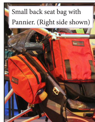
Small back seat bag with Pannier. (Right side shown)