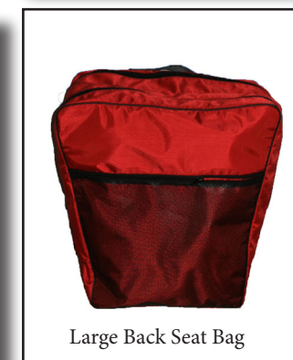
Large Back Seat Bag