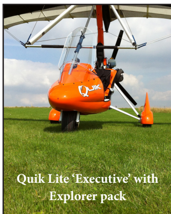
Quik Lite 'Executive' with Explorer pack